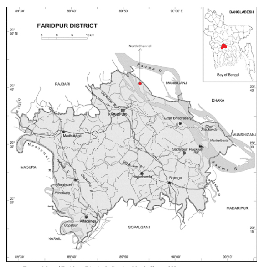
Figure: Map of Faridpur District Indicating North Channel Union

they need to pay BDT 2000 per year per bigha of land. The arrangement varies as per the crop they cultivate. For example, rice farmers get 75% of the harvest, and 'Kalai' (lentils) and 'nut' farmers get only half of the harvest. Mostly single crops are cultivated in a year, but recently double and triple cultivation has been taking place, using local land use adaptation plan. Land use adaption plans mainly focus on increasing the use of land, based on a seasonal calendar which considers the changing pattern of hazard. Production within the char contributes directly to the availability and accessibility of food in the North Channel. According to the local traders, approximately 75% of the rice, 100% of the mustard oil, and