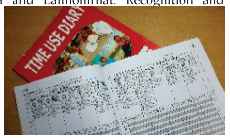
Time Diary, tool used for making couples feel and address the burden of Unpaid Care Work

which is inspiring other women in Gaibandha and Lalmonirhat. Recognition and redistribution of unpaid care work by introducing time diary and daycare have strengthened the collectives. At a societal level, the Women's Collectives approach is contributing to ensure social networking, prevent child marriage, end violence against women, reduce dowry practice, prevent drug use, and undertake risk reduction initiatives during disasters. The goal will be achieved when will take responsibility for unpaid care work rather than helping women out of sympathy.