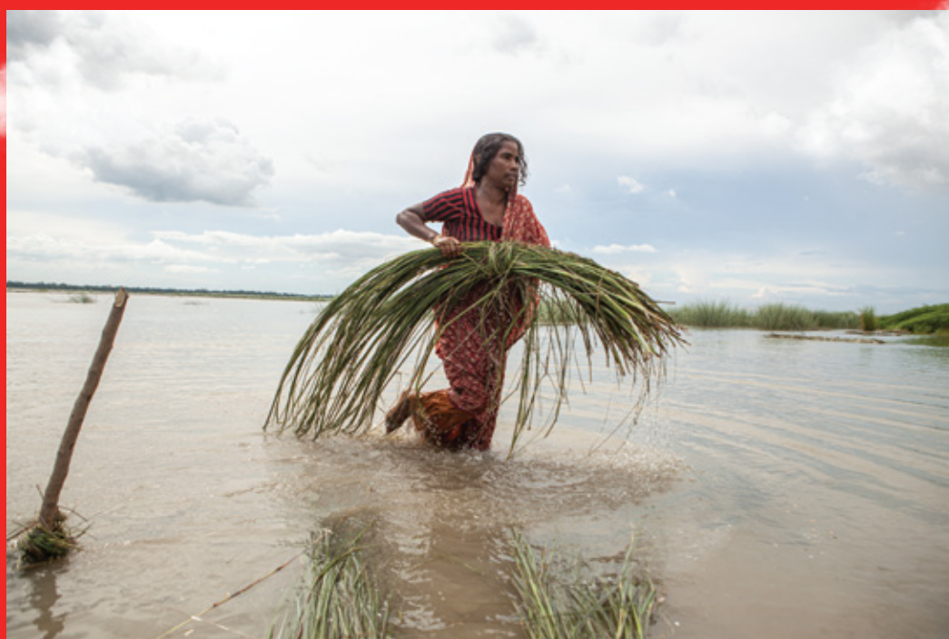
A woman farmer trying to save her crops from flood.